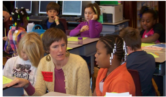
Students at Bloom Elementary brainstorm strategies for de-escalating conflict.

Classroom conflict resolution workshops give a class, or a grade, or even an entire school population, a common language for discussing conflict and the skills to resolve it.